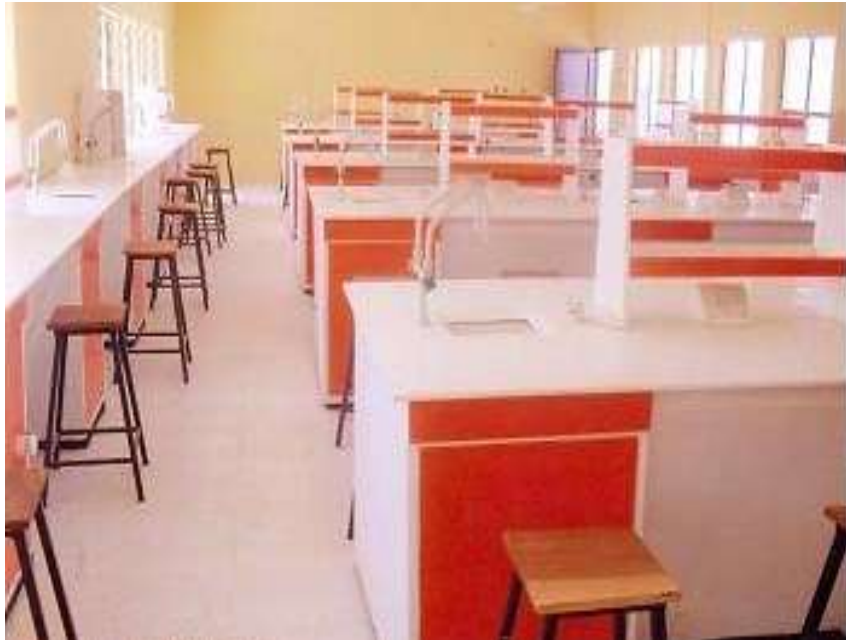
Step B Intervention Lab at Azare, Bauchi State